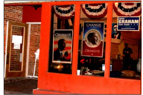
Above—Moving In on Ninth St.

Senator Chuck Graham's Campaign Shares the Space.